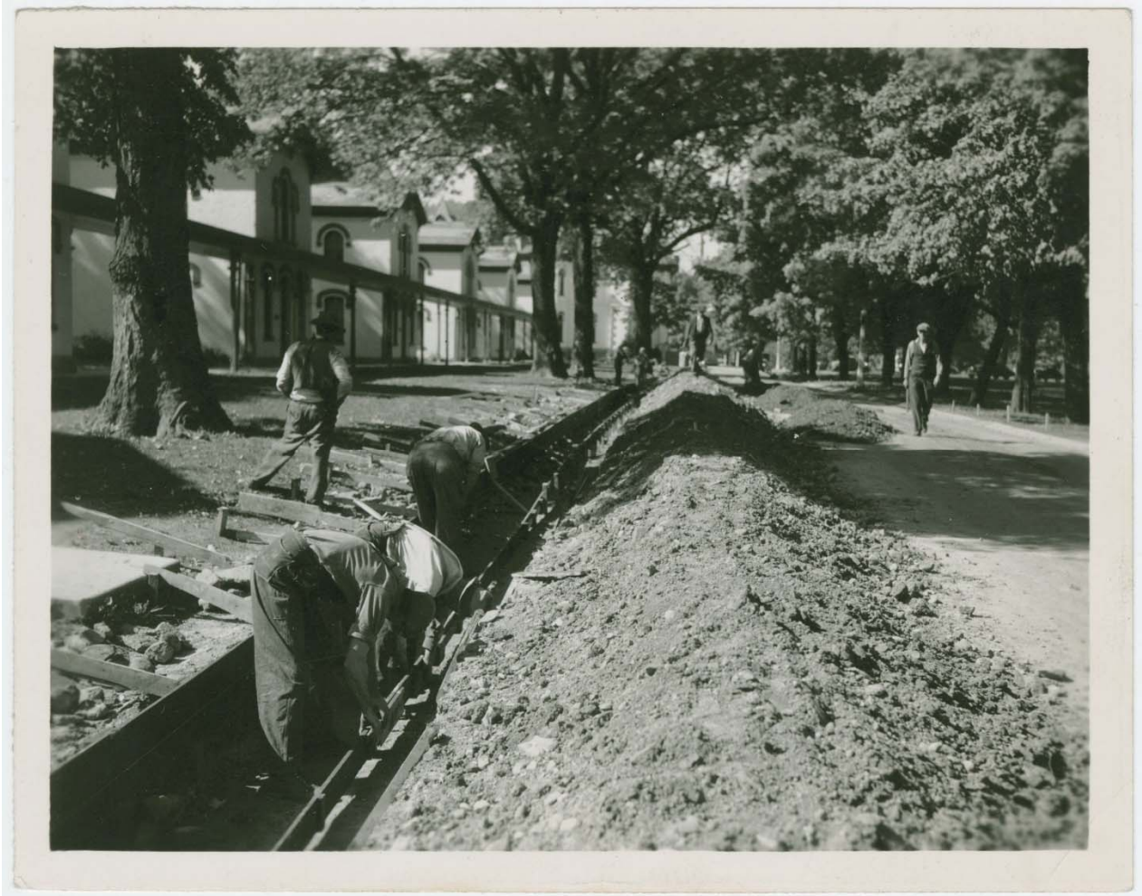
Image: Construction at the Ohio Soldiers' and Sailors' Orphans' Home