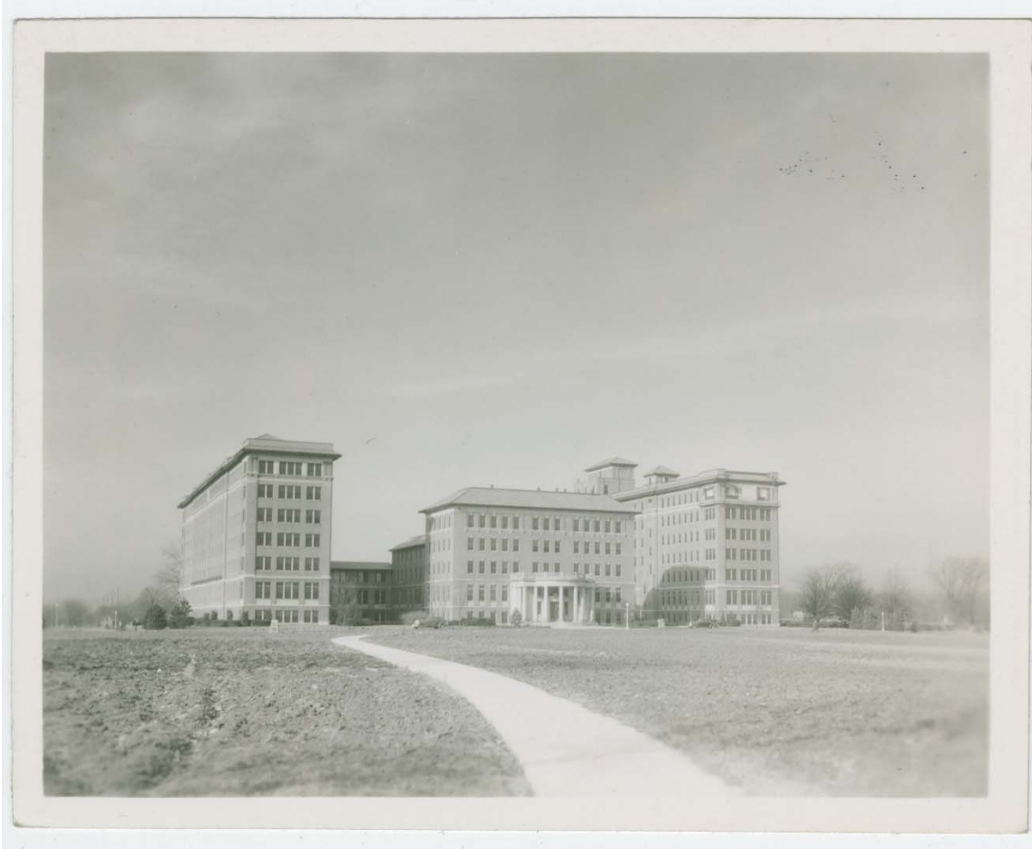
Image: The Brown Hospital on the Soldier's Home campus (Dayton, OH) in 1931.