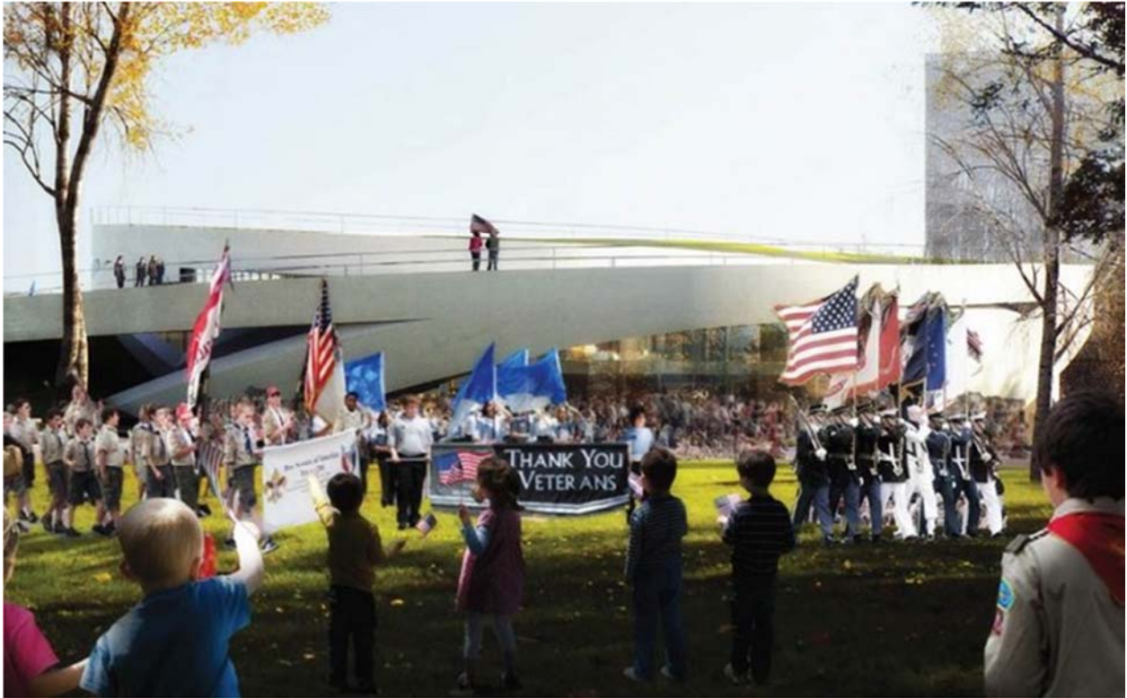
Image: Artist rendering of the National Veterans Memorial and Museum